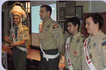
Our Lodge's new Vigil Candidates