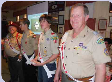
The Silver Fluke recipients receive their award.